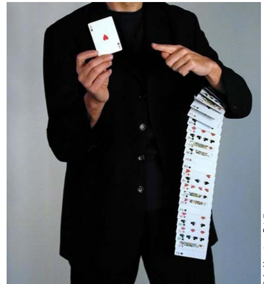
Chancellor uses sleight of hand, as usual

Enterprise Investment Schemes and Venture Capital Trusts also come in for some changes. Principally that the number of employees within investee companies has been limited to 50. A maximum of £2 million now applies to the amount of capital (from any relevant scheme) that can be raised within a 12 month period, by each investee company. He has also relaxed the time-frame for EIS managers to invest their cash from six to 12 months, which